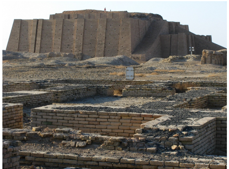
Ruins of the Great Ziggurat of Ur, where Abraham was from (Gn 11.28-31), built ~2000BC, restored by King Nabonidus ~550BC.